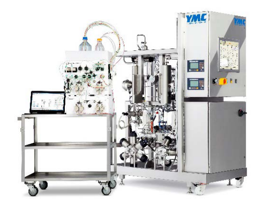
Figure 1: Successful scale up of 100x on 2-column continuous capture systems from bench to GMP pilot.

MCC by itself substantially intensifies the capture process with productivity gains of nearly 3X (1). The YMC manufactured system not only provides a simple 2-column method for continuous capture (a patented process by YMC ChromaCon<sup>®</sup> AG), it also combines 4 additional unit operations in a single skid. The multifunction capability enables process intensification that significantly enhances productivity, while minimizing facility footprint, increasing asset utilization, and reducing cost.