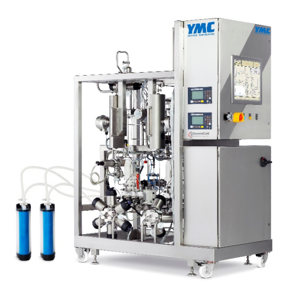
Figure 5: YMC TWIN is also in operation using pre-packed disposable chromatography columns.

(4) Mary Jo Wojtusik, Kurt Wilner, Low Pressure Liquid Chromatography Using EcoPrime LPLC with Enhanced Buffer In-Line Dilution, BioProcess J.,15(3)2016:14-19