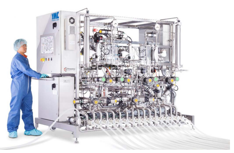
Figure 4: YMC Twin with batch, continuous capture (CaptureSMB), buffer in-line dilution (BID) and sequential polishing capabilities. Also shown is the optional single-use buffer management manifold.

Units with the functionalities mentioned above are now commercialized with a flow ranges of up to 20 L/min, a platform enabling small to large production on the same system.